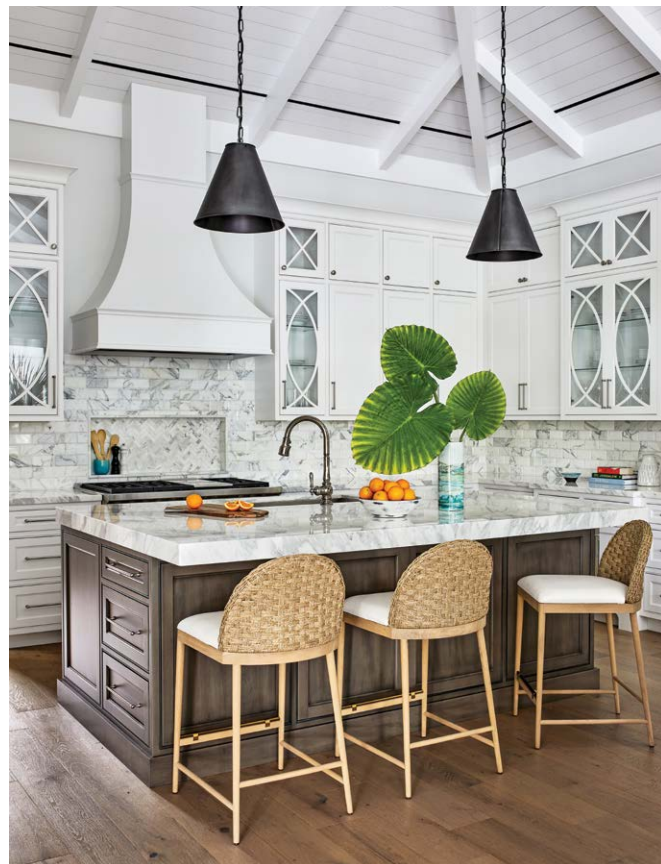
ABOVE: The island countertop in the kitchen is clad in Calacatta ORO marble. Tucked beneath the lip that extends beyond the dark cabinetry are counter stools made of oak with woven backs and linen seats. The pendants hanging above are made of black glass.